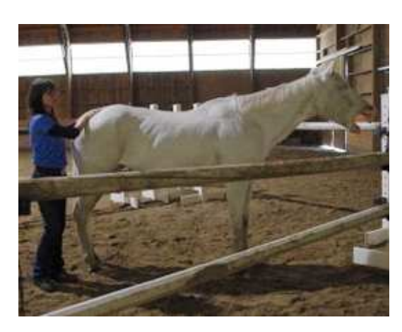
Reiki works in conjunction with other medical treatments to reduce side effects and promote recovery.

Reiki helps to clear any blockages in the body, aiding in reduction of pain and speeding up the healing process.